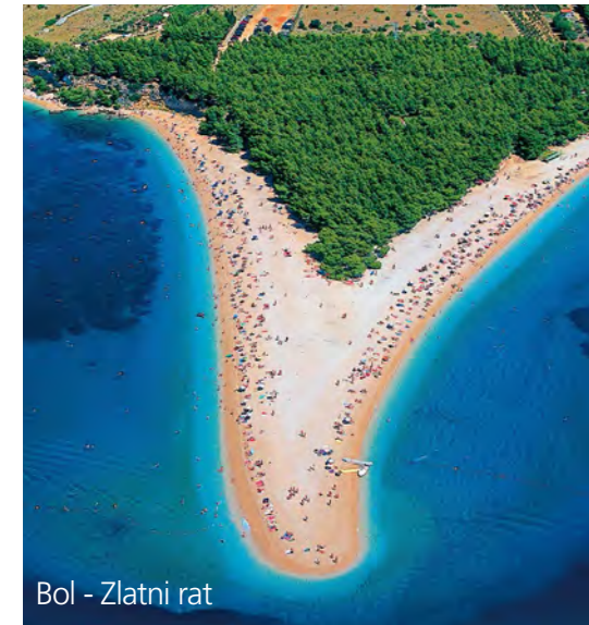
Bol - Zlatni rat

after breakfast departure for swimming and lunch, and overnight in Bol.