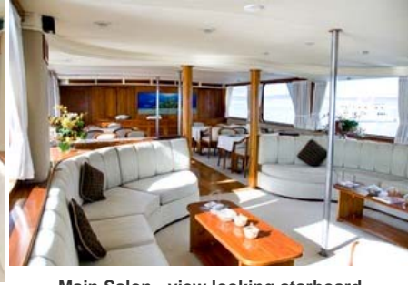
Main Salon - view looking starboard