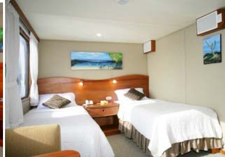
1 of 7 Twin/King Convertible Cabins