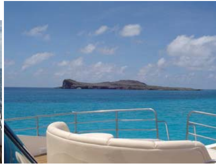
Forward Seating on the Bow