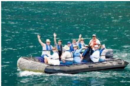
1 of 2 Zodiac tenders