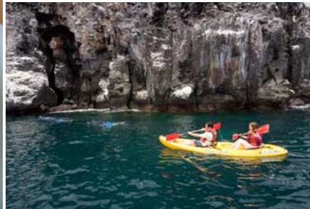
Kayaking and Snorkeling