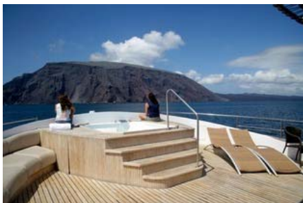
Sun Deck with Jacuzzi