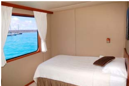
1 Single Cabin with Twin Bed