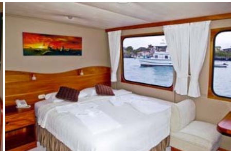
1 of 7 King/Twin Convertible Cabins