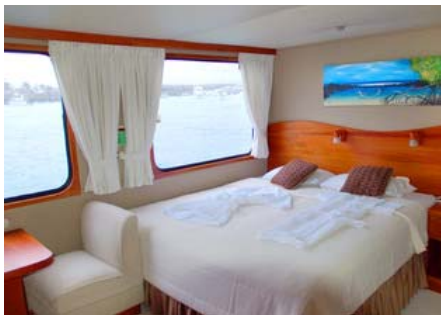
1 of 7 King orTwin convertible cabins