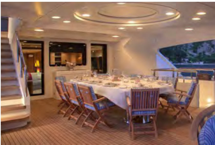
Bridge Aft deck Dining