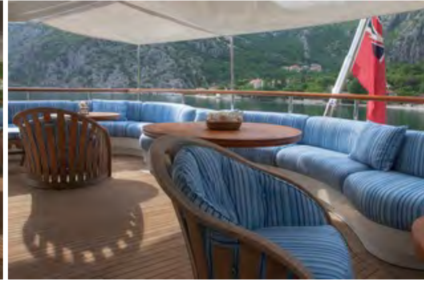
Bridge Aft deck