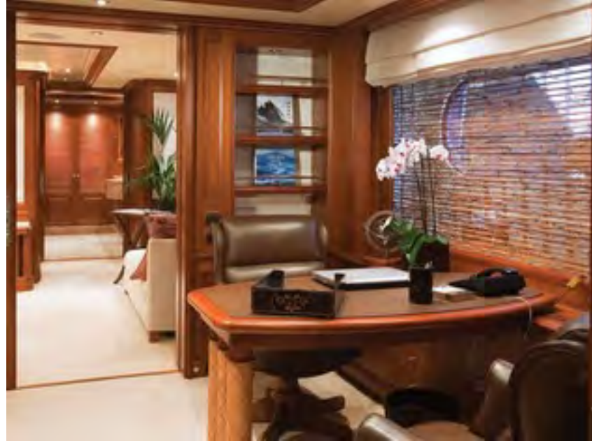
Master Suite Office