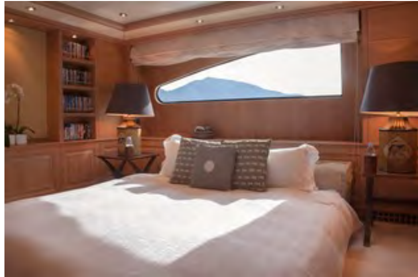
Convertible Games room