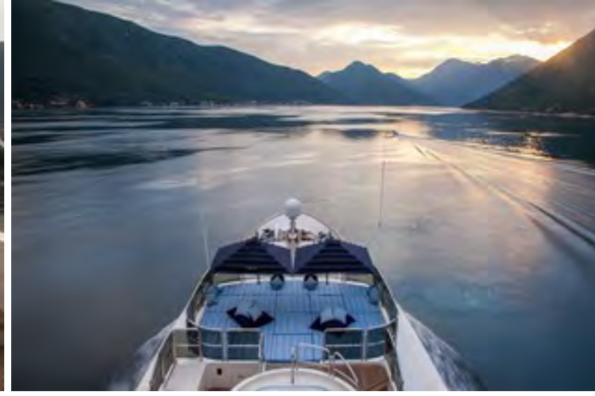
Sun deck Sun pads