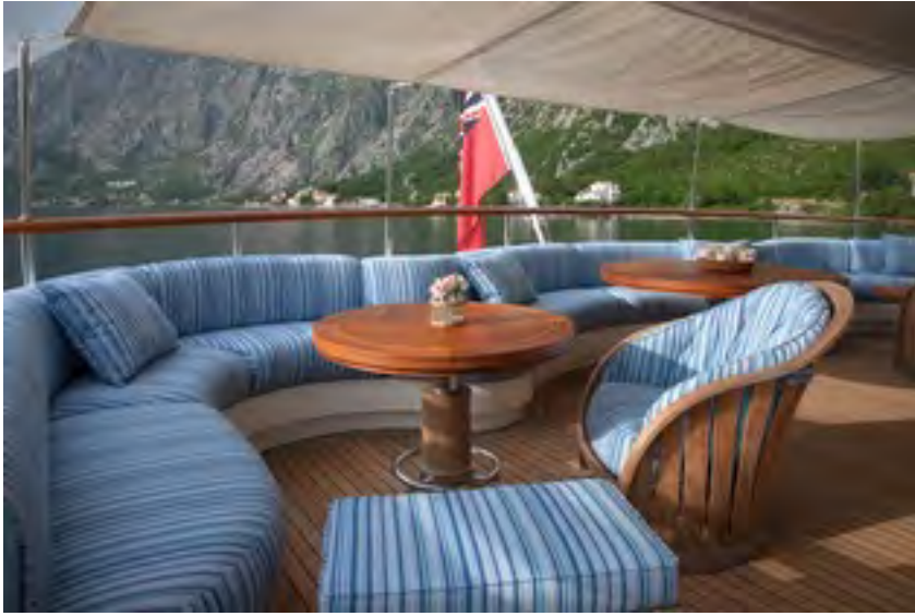
Bridge Aft deck