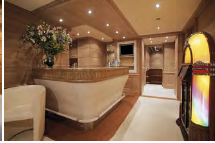
Sky Lounge Bar