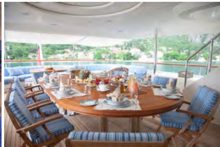
Bridge Aft deck Dining