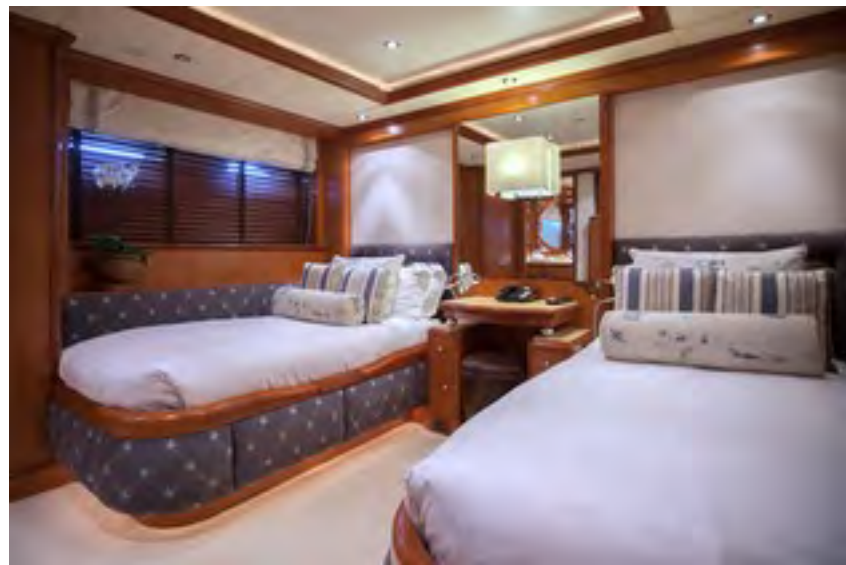
Twin Ralph Lauren