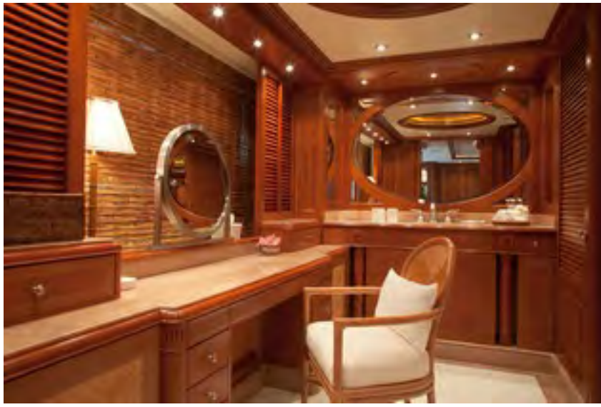
Master Suite Dressing