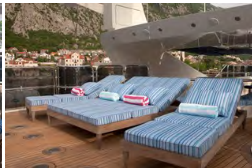
Sun deck Loungers