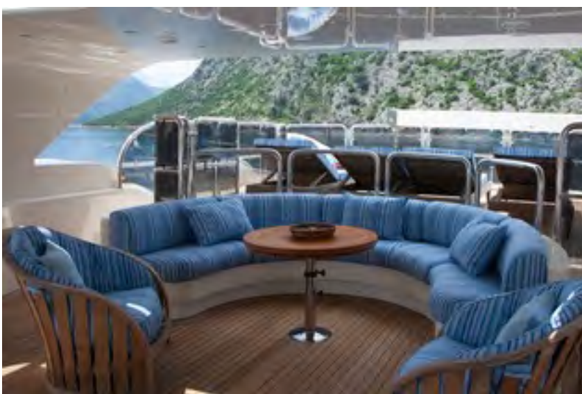
Sun deck seating