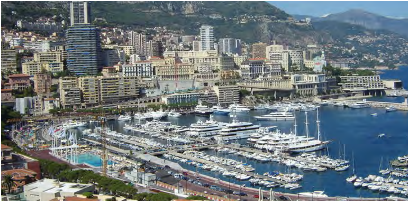
Visit Monaco home of the Formula One Grand Prix