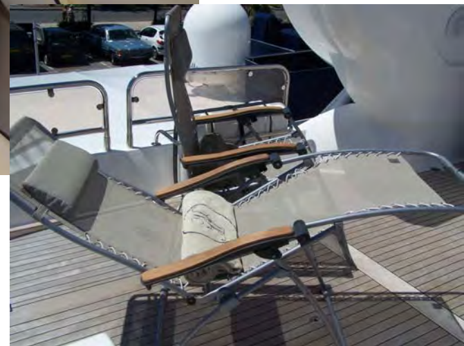
The sundeck set for dining and relaxing chairs.