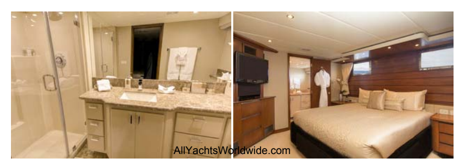
King guest stateroom