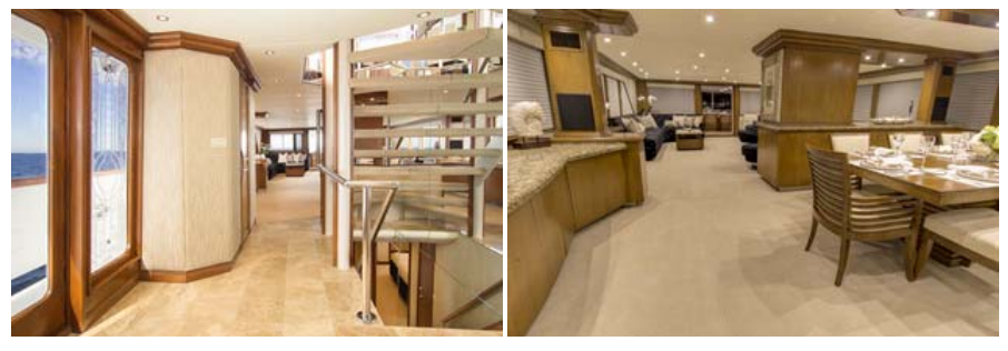
Foyer to guest staterooms