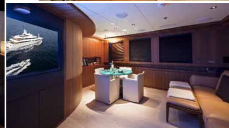
UPPER DECK: aft deck with awning and dining for 12, lounge area and formal dining table, Portuguese Bridge with table for 10, Pantry, and separate video/meeting room located aft of the Bridge.