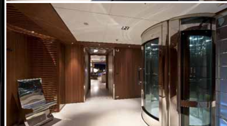
SUN DECK: extensive aft deck with large sun-tan areas, Jacuzzi and Gym. Side passerelle and main entrance, foyer and a large glass lift, serving the four decks, right from the Lower Deck up to the Sun Deck.