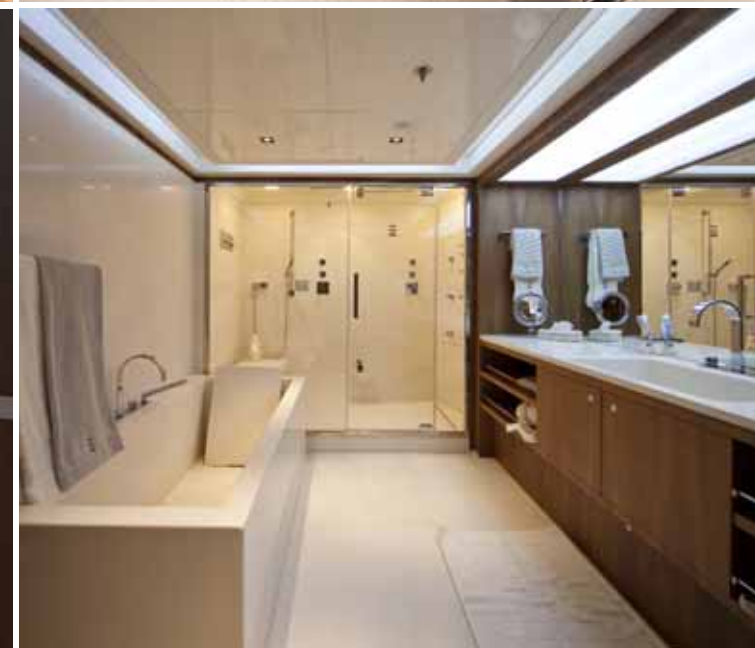
MASTER STATEROOM: located on the Main Deck, full beam, with office, walk-in closet and large en suite bathroom.