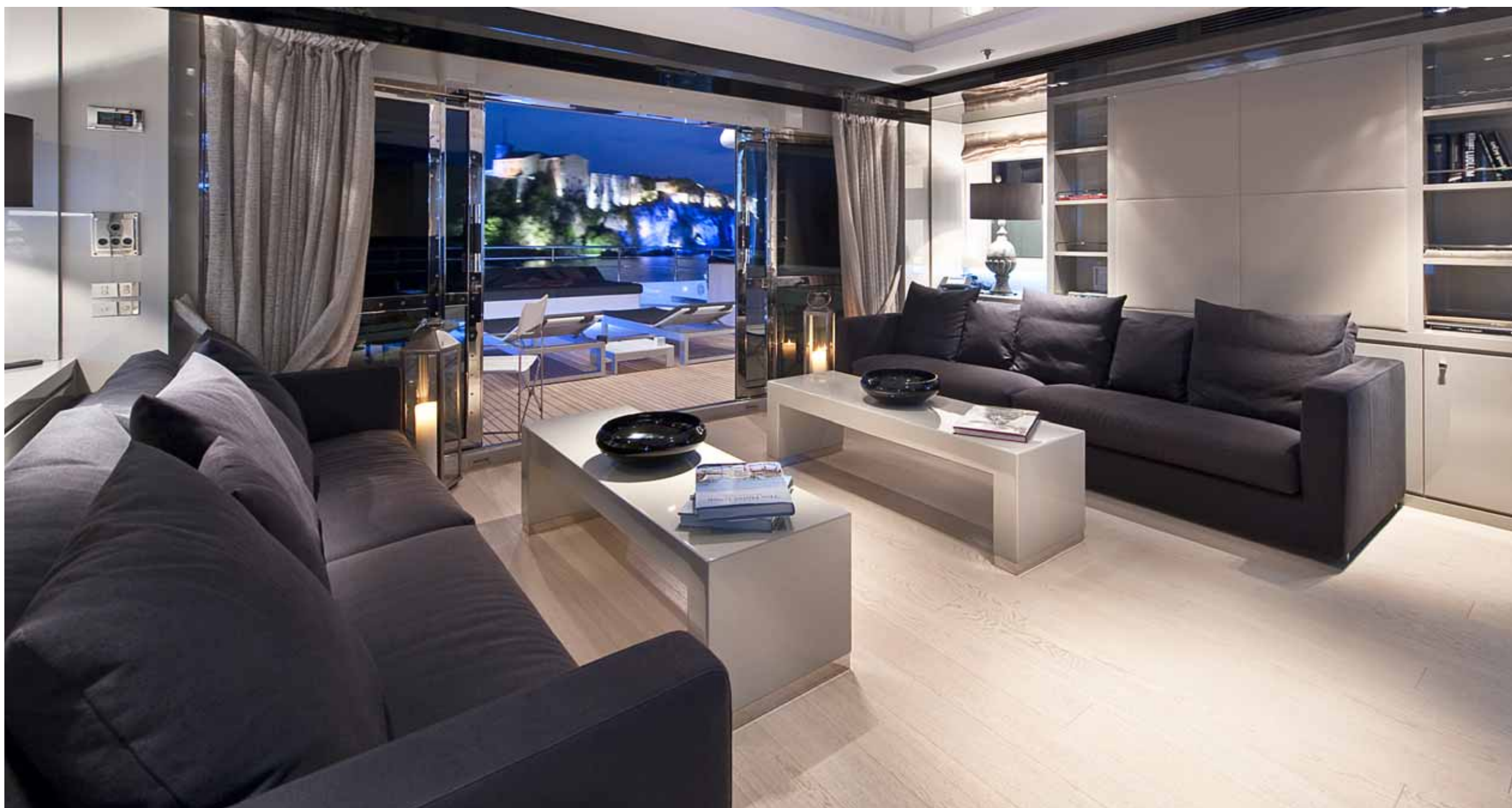
The Sun Deck lounge with entertainment center, located in between the aft deck and the Gym is decorated with modern design furniture.