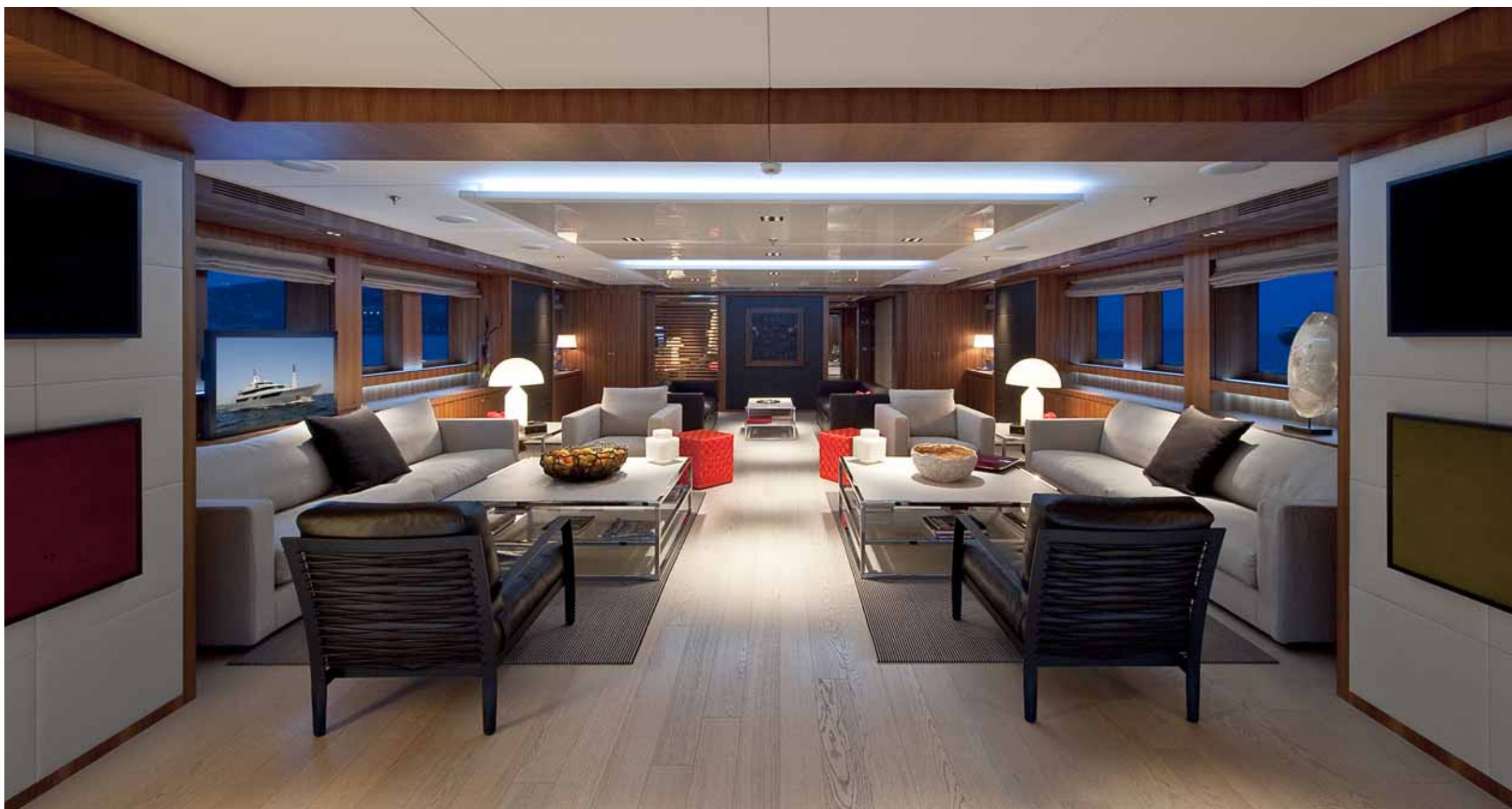
MAIN SALON: It is a favorite gathering place with wooden floor and design furniture, inviting sofas and clear but sheltered view of the sea.