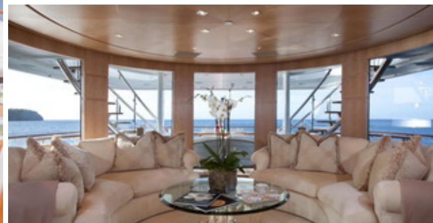
Upper Deck Living Room