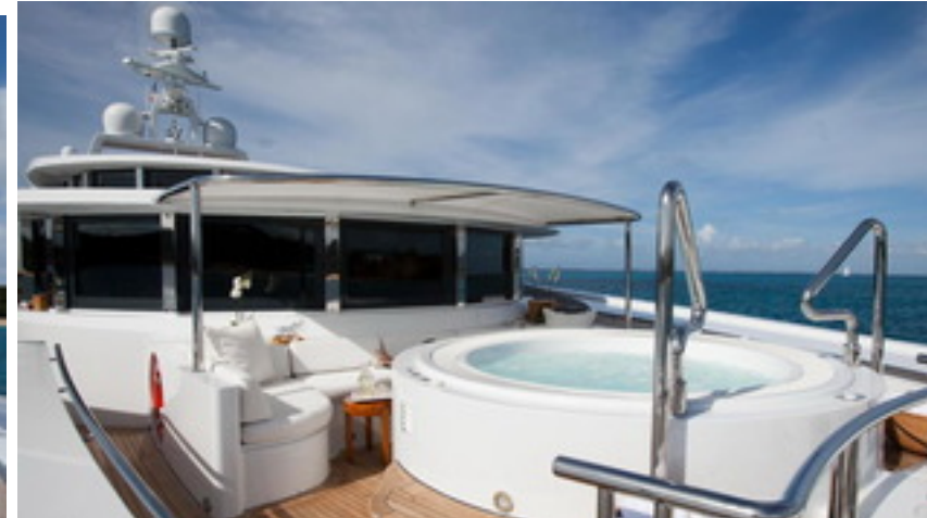
Master Cabin Private Terrace and Jacuzzi