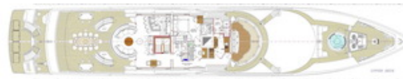
Upper Deck Plan