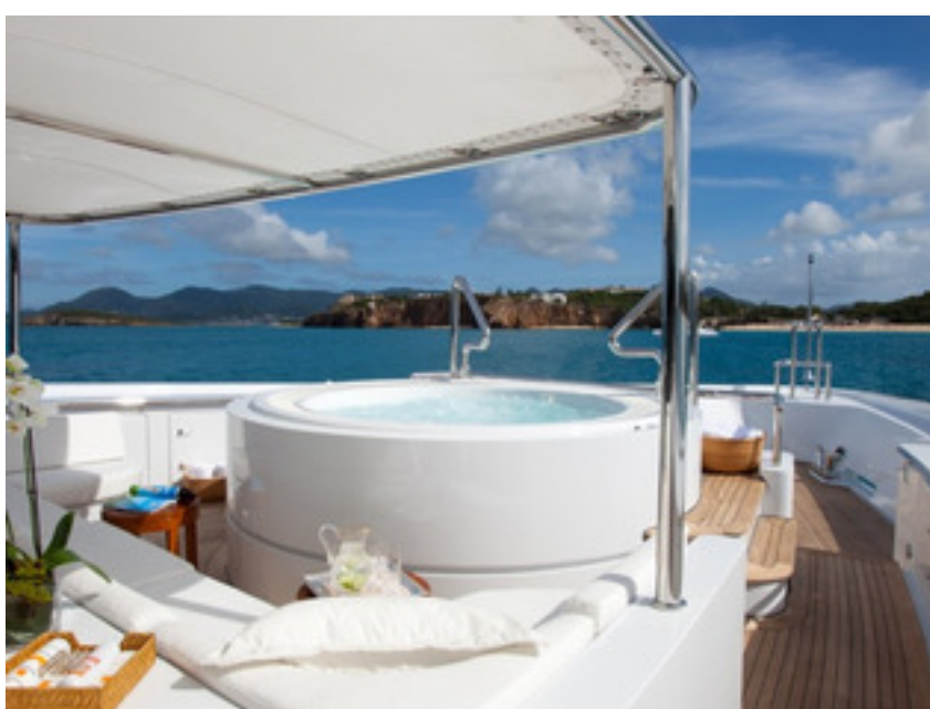
Master Cabin Private Jacuzzi