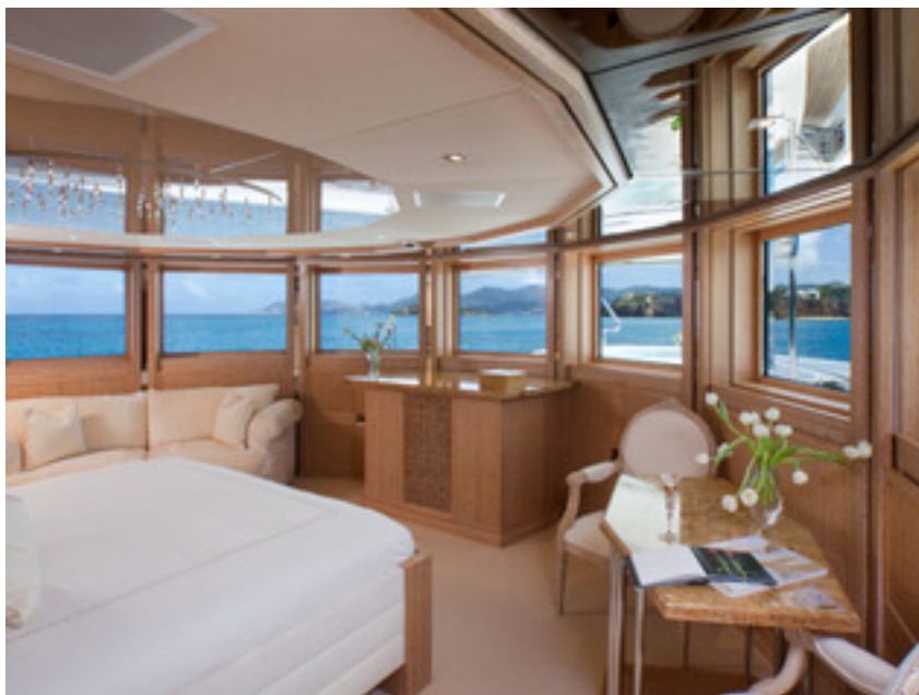
Master Cabin with Panoramic Windows