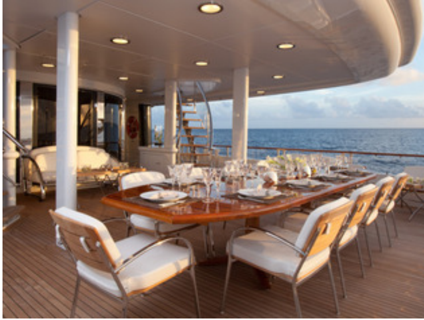
Upper Deck Dining