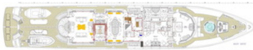
Main Deck Plan