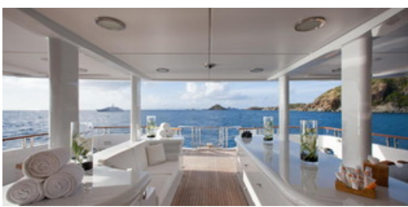
Main Aft Deck