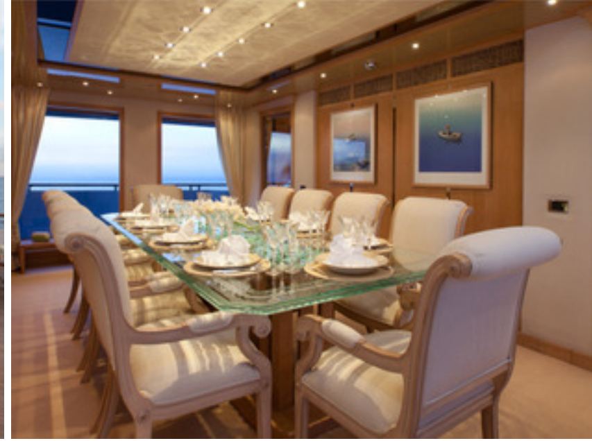
Main Deck Dining Room