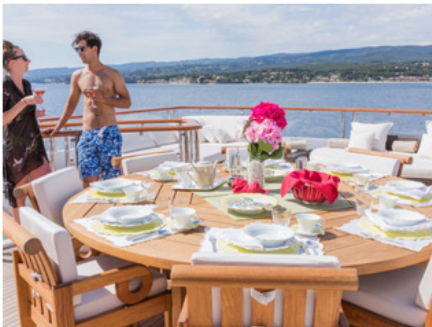
Sun Deck Dining