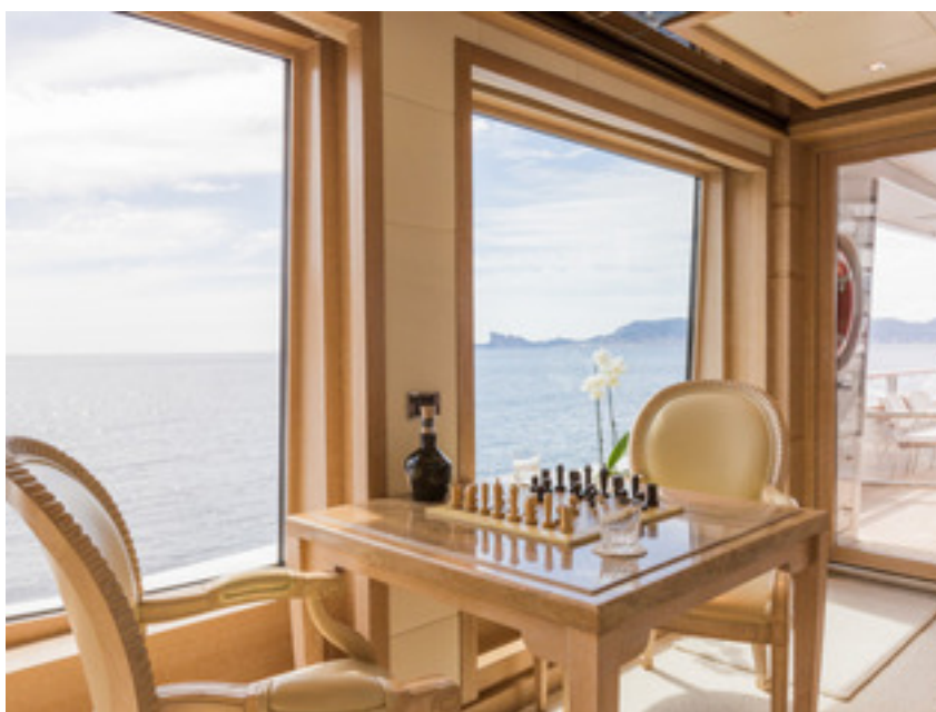
Upper Deck Living Room