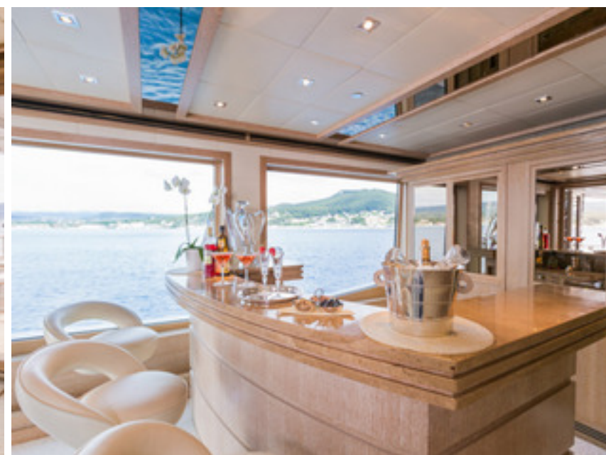
Upper Deck Living Room