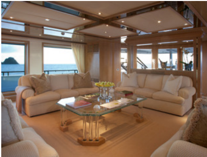
Main Deck Living Room