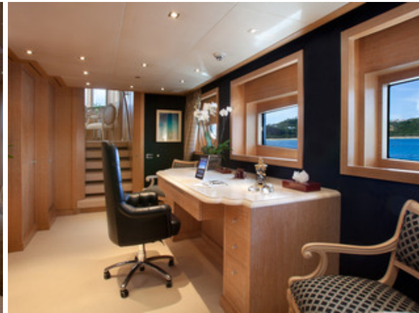
Master Cabin Study