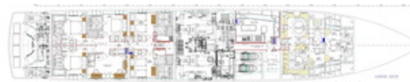
Lower Deck Plan

This document is not contractual. All specifications are given in good faith and offered for informational purposes only. The publisher and company do not warrant or assume any legal liability or responsibility for the accuracy, completeness, or usefulness of any information and/or images displayed. Yacht inventory, specifications and charter prices are subject to change without prior notice. None of the text and/or images used in this brochure may be reproduced without written consent from the publisher.