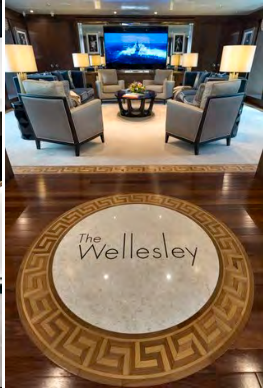
Main Salon entrance