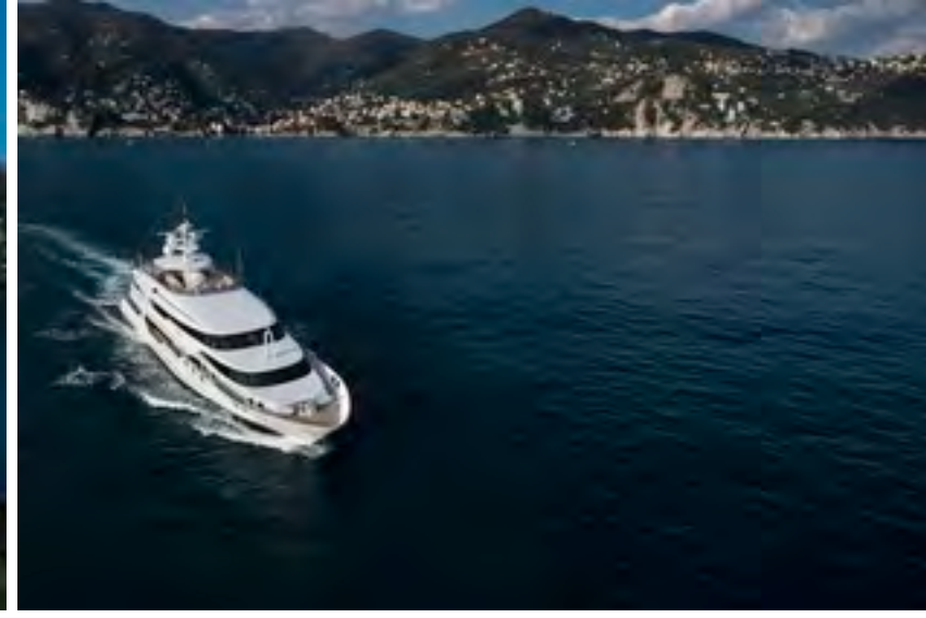
Running shot 2