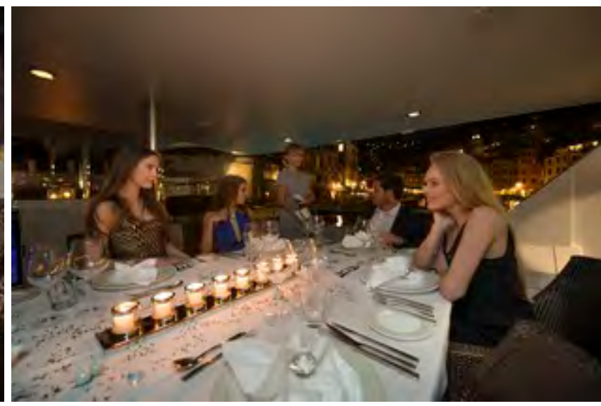
Evening dining aft deck