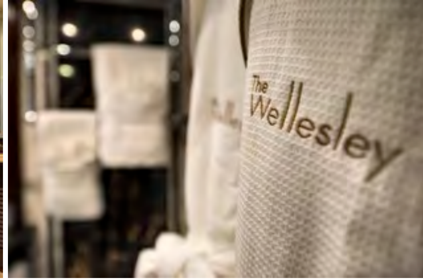
Robes in the master bathroom