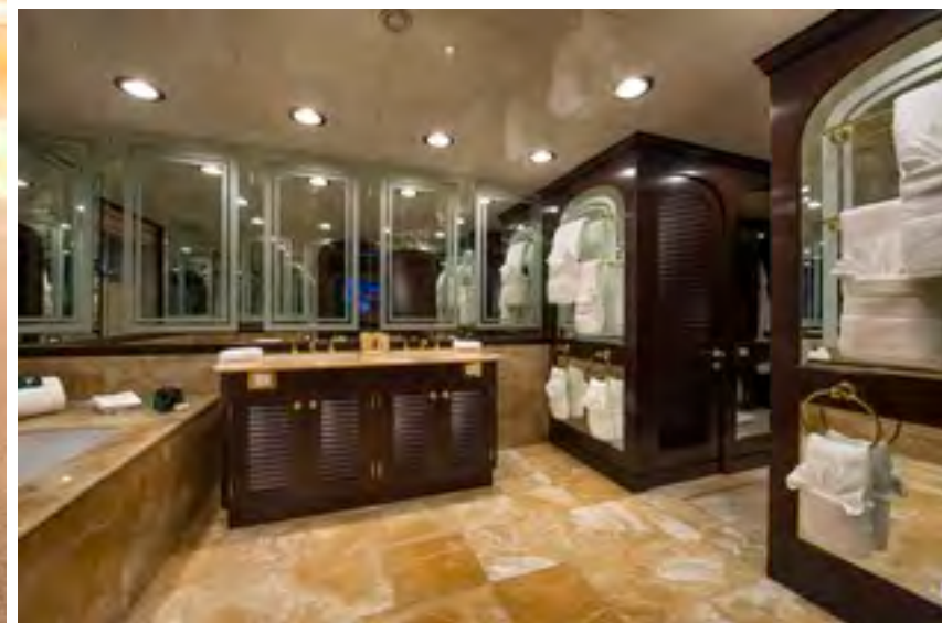
Lower master bathroom