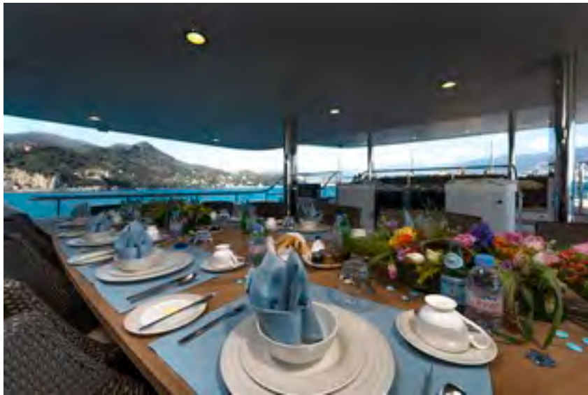
Breakfast setting lower aft