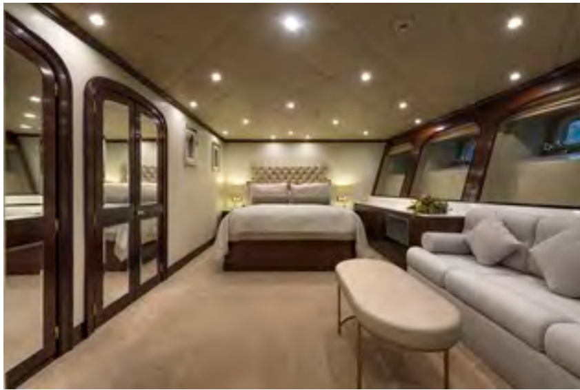
Guest double suite