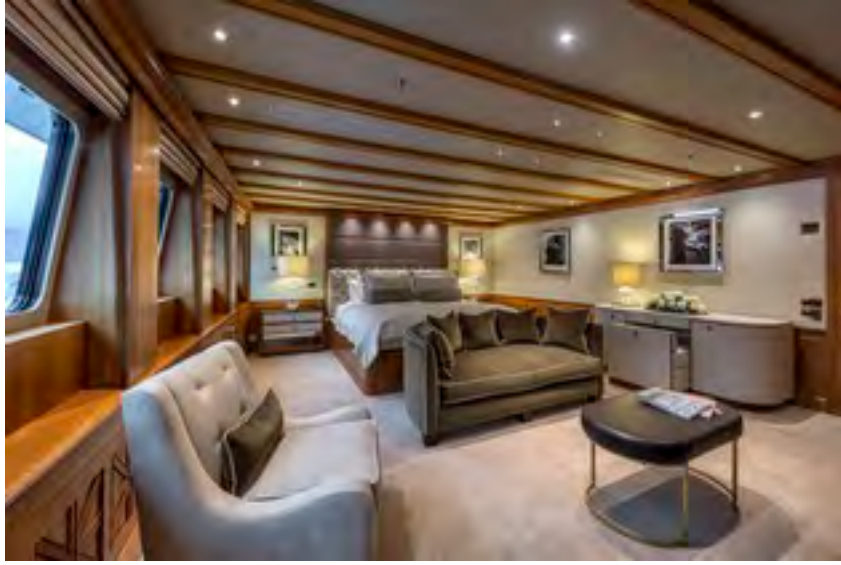
Master suite - upper deck