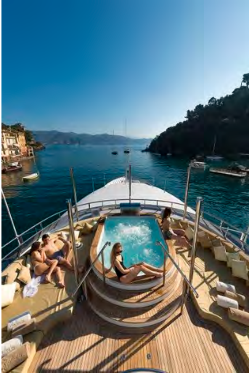
Waterfall Jacuzzi forward