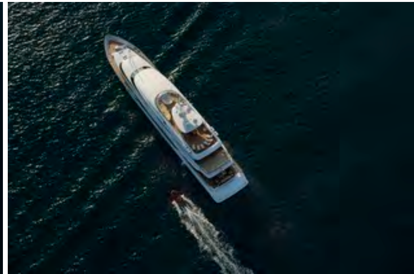
Aerial shot 2