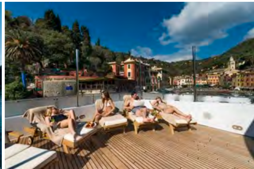
Upper deck loungers