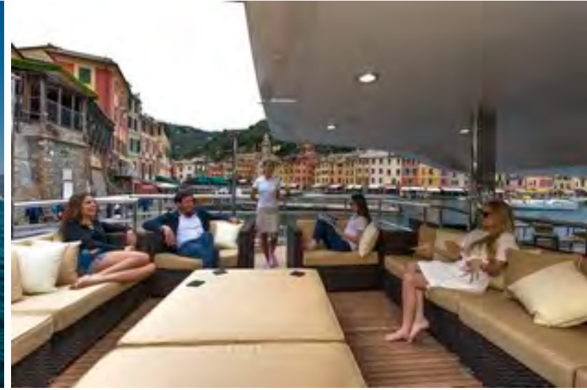
Lower aft deck