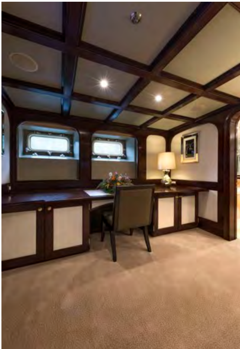
Lower Master study