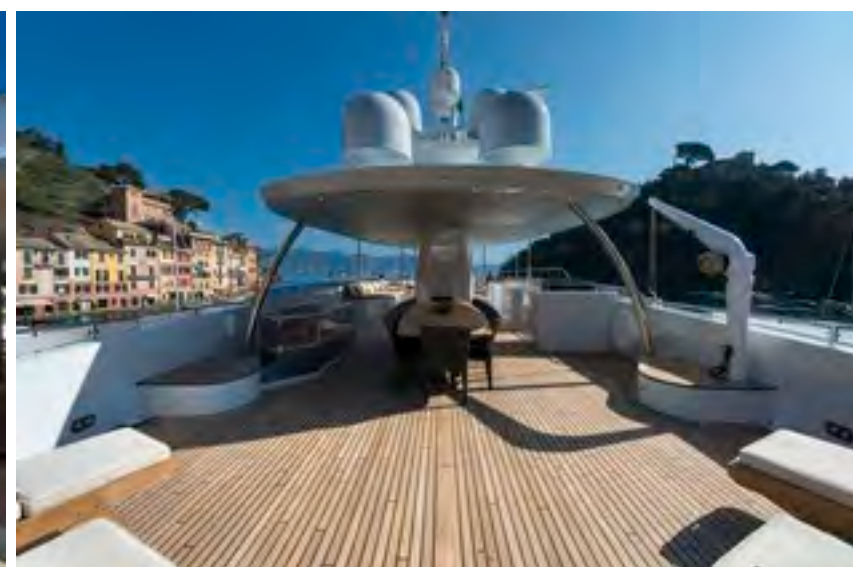
Upper deck full profile