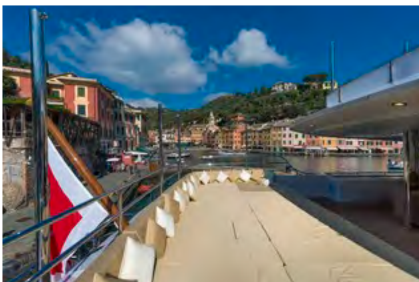
Main deck sunpads aft