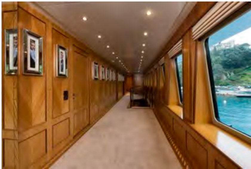
Upper deck corridor to Master and Twin