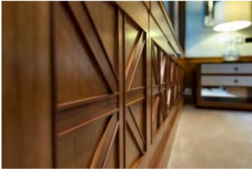
Wood detail in Master