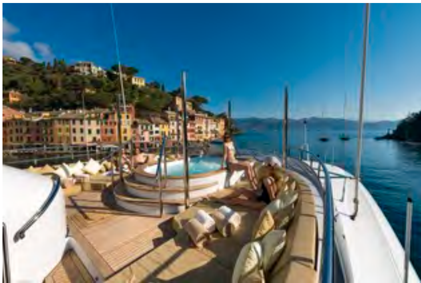
Waterfall Jacuzzi and sunpads