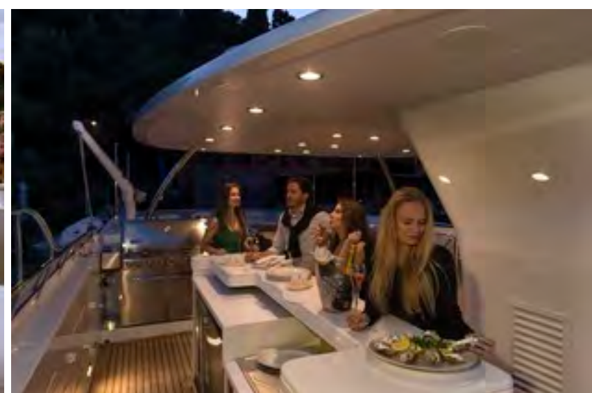
Upper deck bar