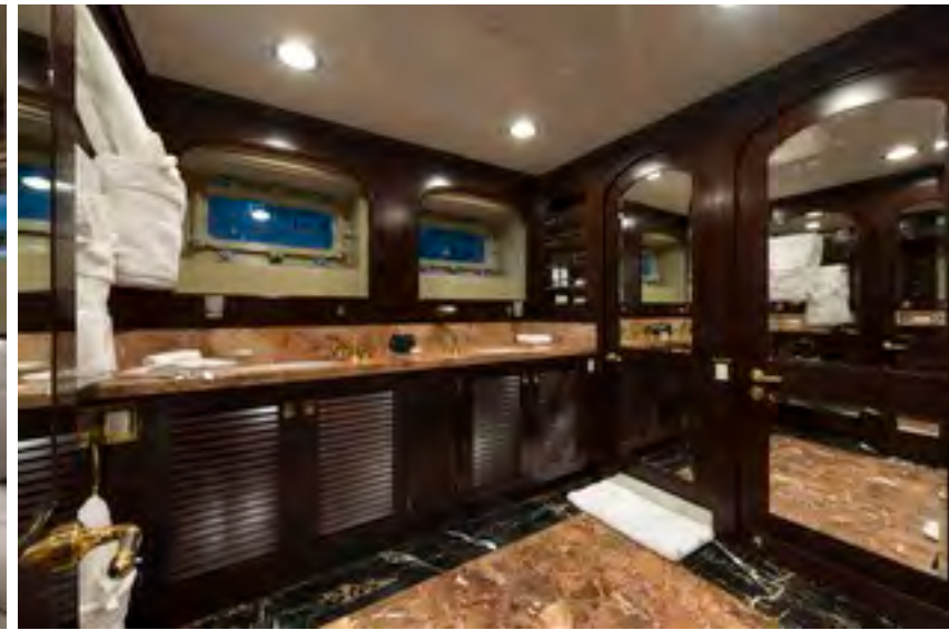
Guest double bathroom