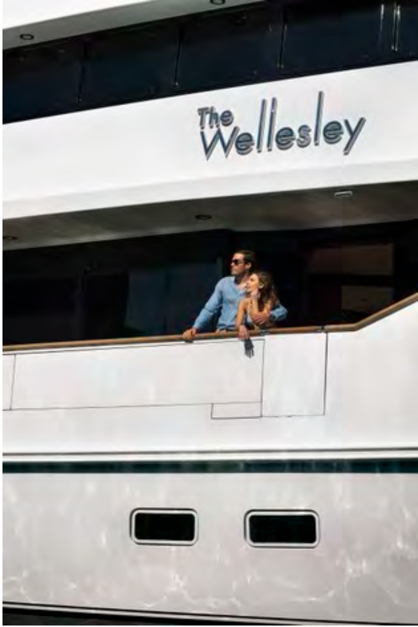
Side profile logo