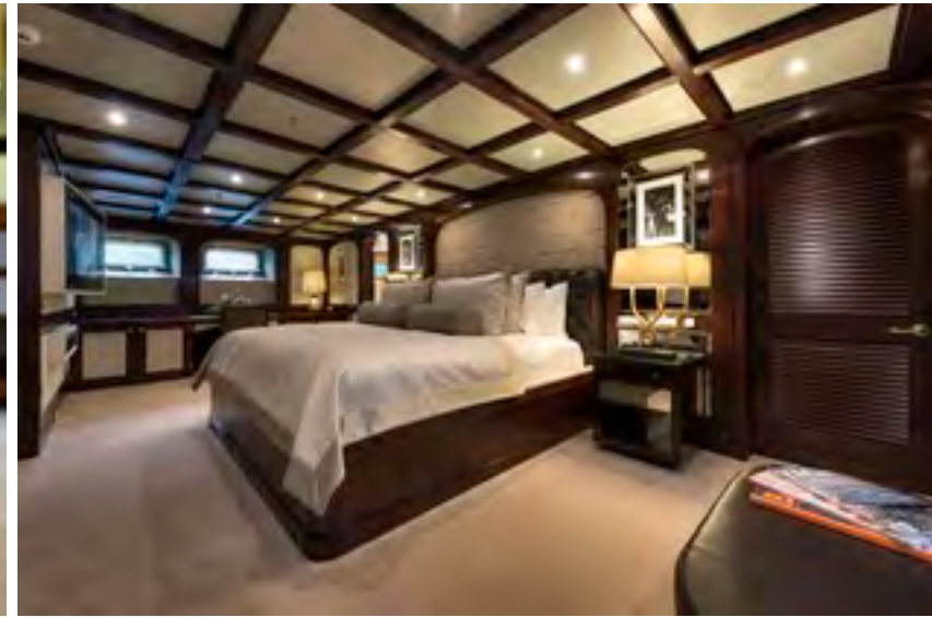
Lower Master suite