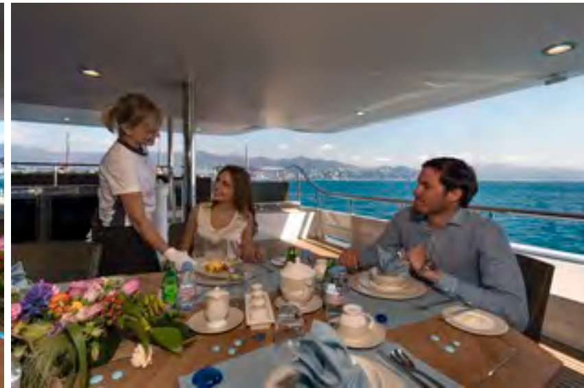
Breakfast lower aft