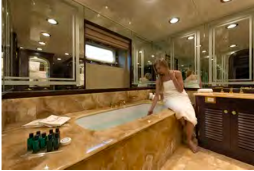
Lower master bathroom 2