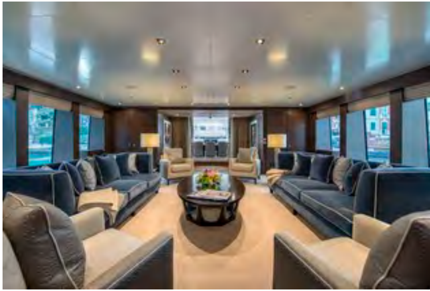
Main Salon forward to aft