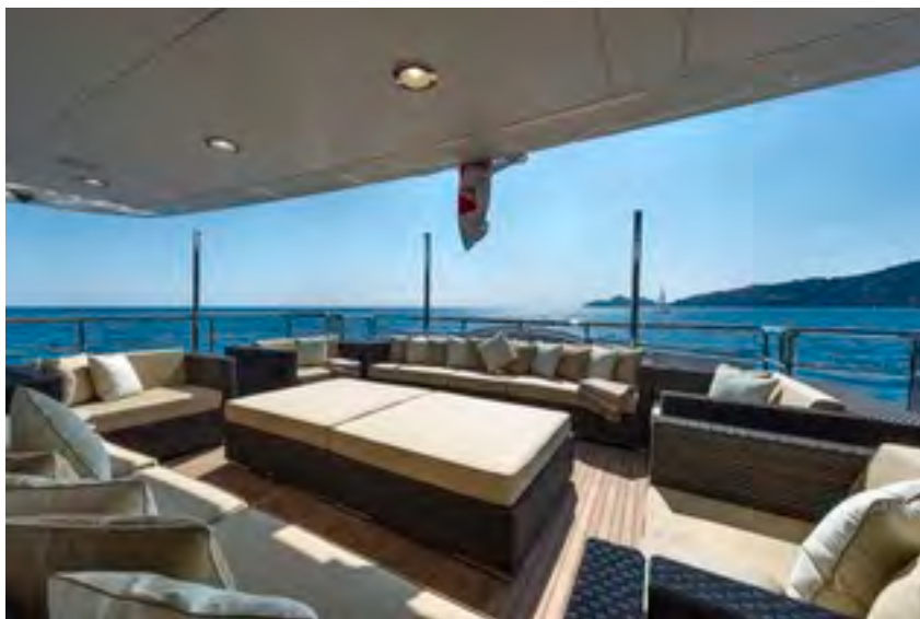
Lower aft deck seating