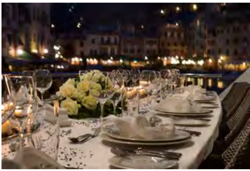
Aft Dining setting in Portofino