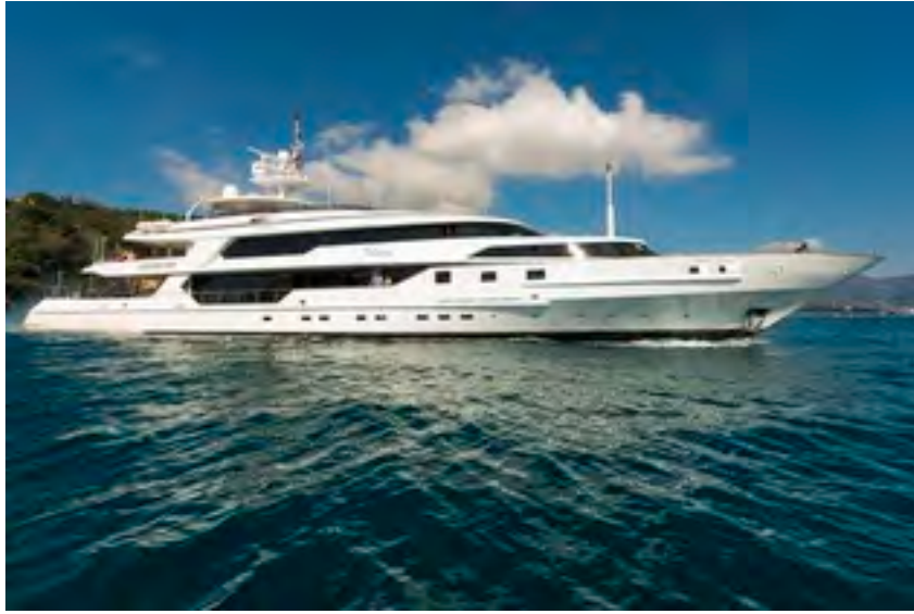
Profile - THE WELLESLEY