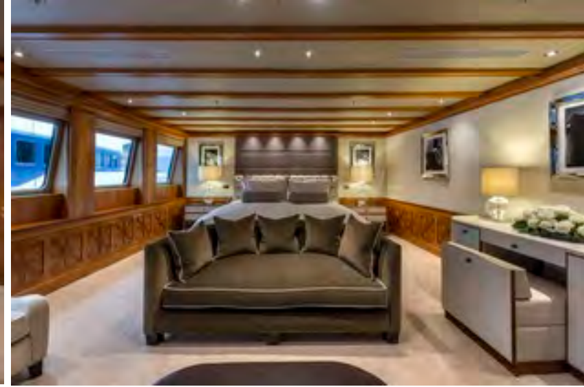
Master suite - upper deck