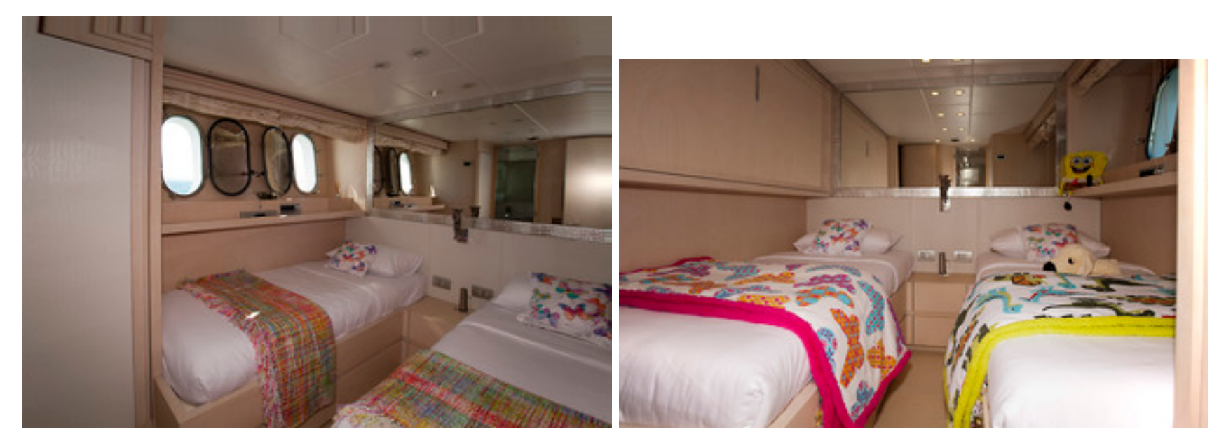
VIP cabin on main deck