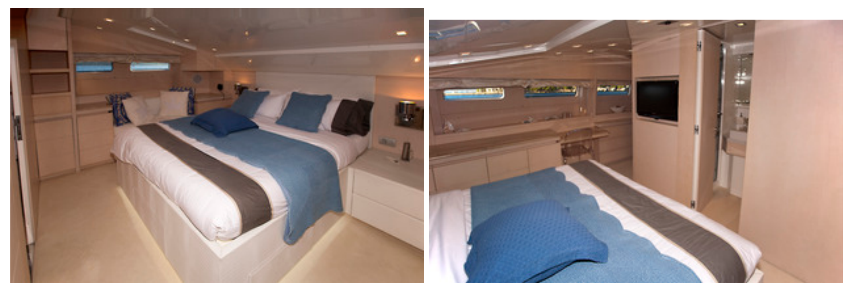
VIP cabin on main deck