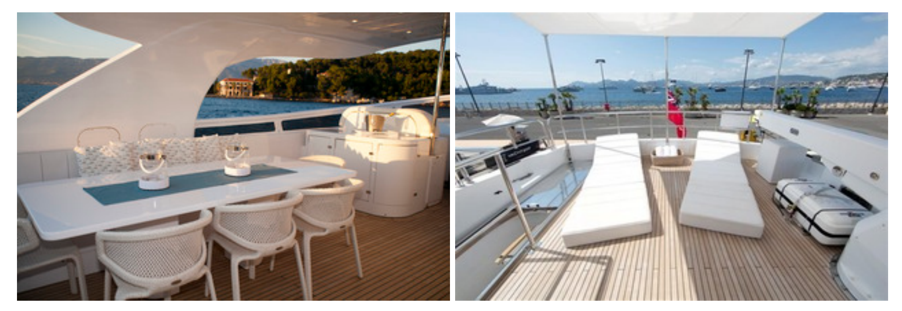
Flybridge - Dining area